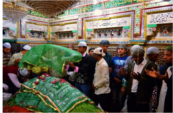
Inside a Sufi Shrine in India