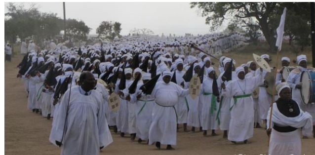
Shembe worship in South Africa