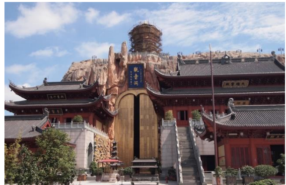
Donglin Temple, Shanghai